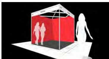
Flush Fitting Graphic